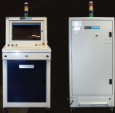
Processing Control Unit