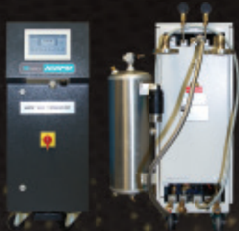
Heat Transfer Unit